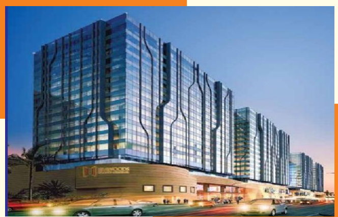
Seawoods Grand Central Tower -Mumbai