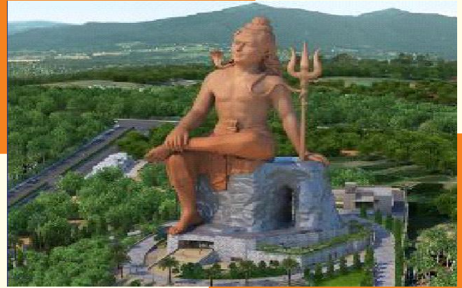
STATUE OF BELIEF -Rajasthan