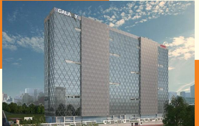
Galaxy Towers - Hyderabad