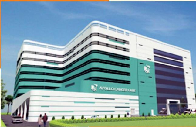
Apollo Proton Therapy and Cancer Care Hospital Project for using Temperature Controlled Concrete -Chennai