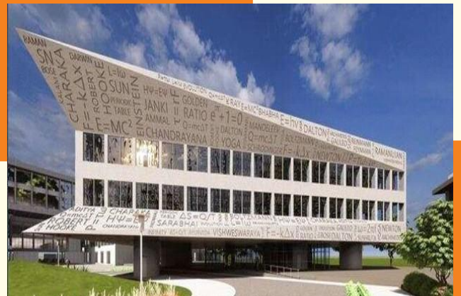
Permanent Campus for IISER, Tirupati