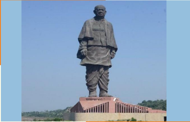
STATUE OF UNITY -Gujarat