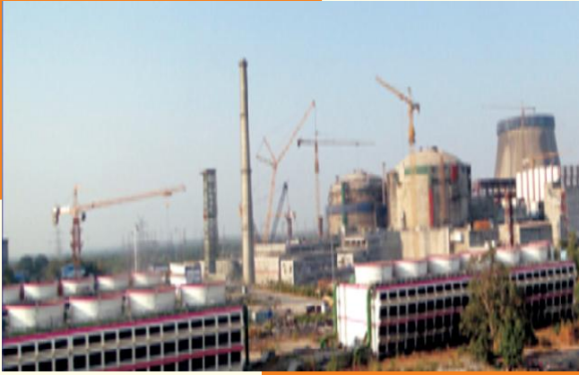
Kakrapar Atomic Power Project High Volume Fly Ash in Nuclear Reactor Dome Construction -Gujarat