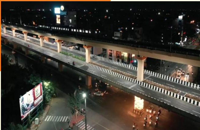
Double Decker Viaduct on Wardha Road-Nagpur