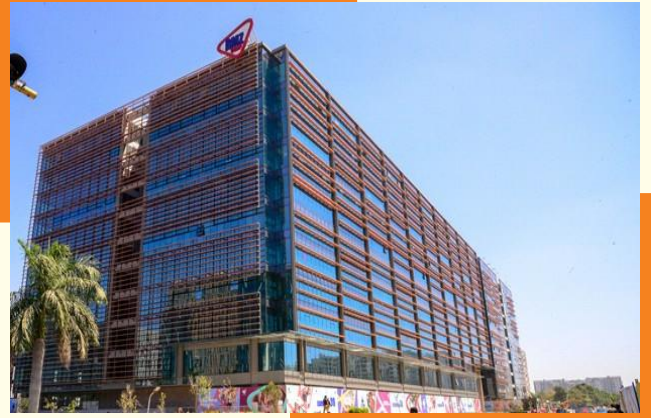
RMZ ECO World Campus, Bengaluru