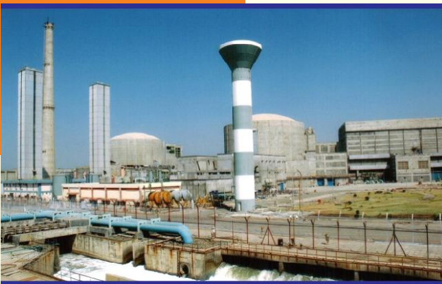
Bhabha Atomic Research Centre Tarapur