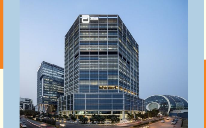
Godrej BKC -Mumbai