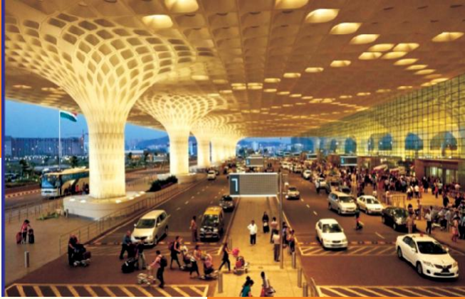
Chhatrapati Shivaji International Airport Mumbai