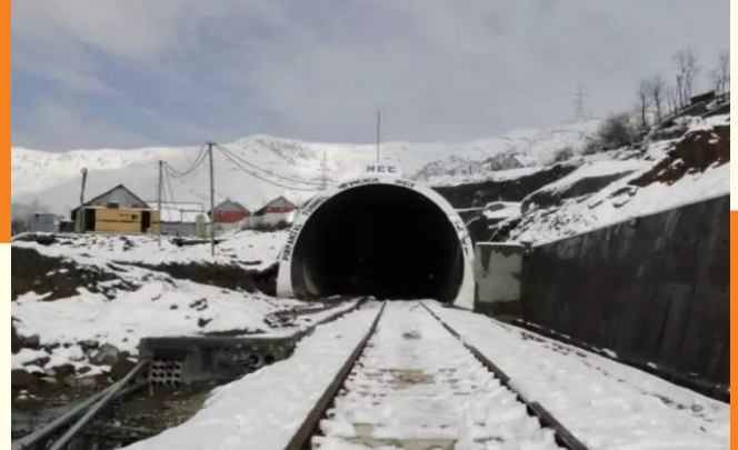
Pir Panjal Railway Tunnel - Jammu & Kashmir