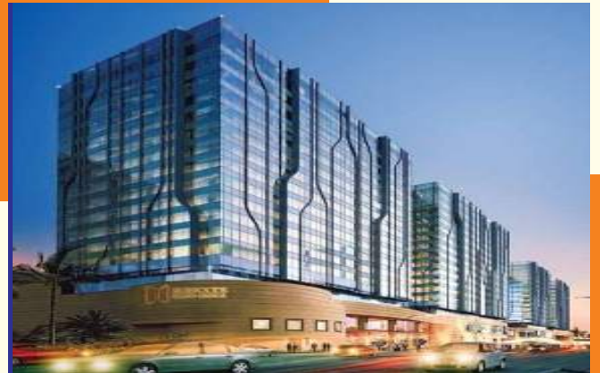
Seawoods Grand Central Tower -Mumbai