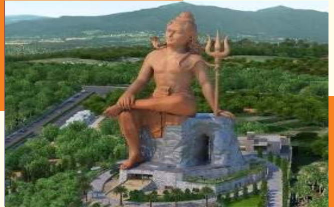
STATUE OF BELIEF -Rajasthan