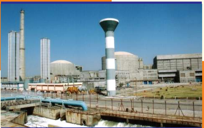
Bhabha Atomic Research Centre - Tarapur