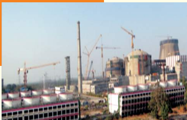
Kakrapar Atomic Power Project High Volume Fly Ash in Nuclear Reactor Dome Construction -Gujarat