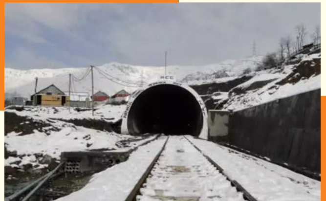
Pir Panjal Railway Tunnel - Jammu & Kashmir