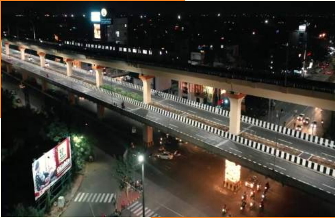
Double Decker Viaduct on Wardha Road-Nagpur