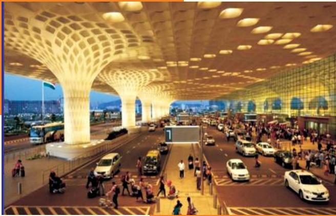
Chhatrapati Shivaji International Airport Project Mumbai