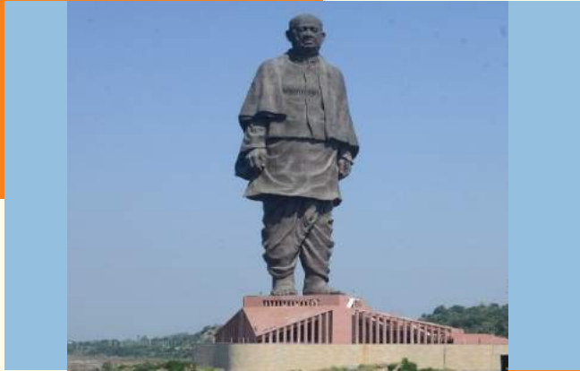
STATUE OF UNITY -Gujarat