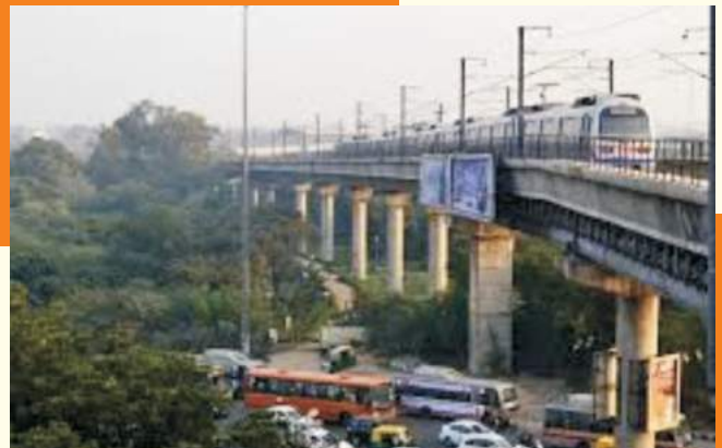
DMRC - CC87 New Delhi