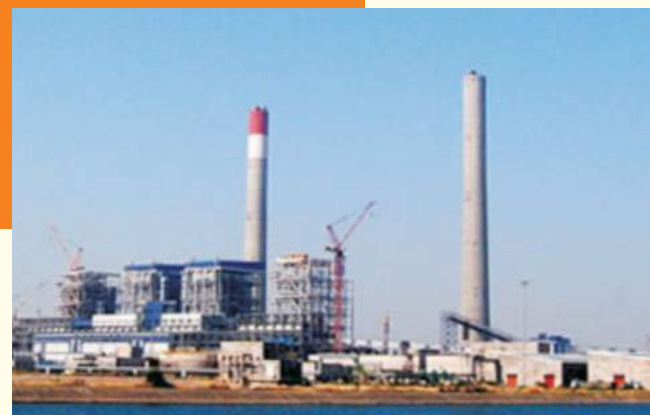
275 m high Chimney at KMPCL Subcritical Thermal Power Plant, Chhattisgarh

Submit all Entries(as soft copy)/Queries to: