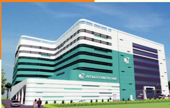
Apollo Proton Therapy and Cancer Care Hospital Project for using Temperature Controlled Concrete -Chennai