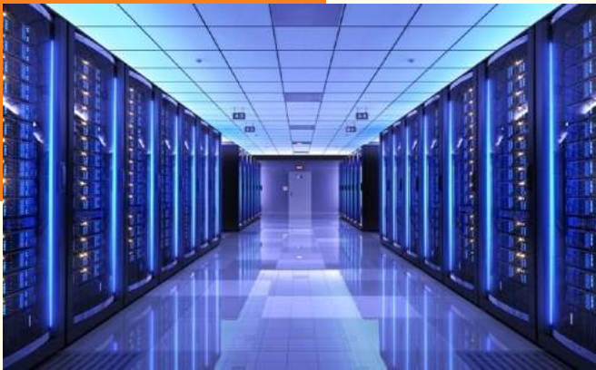
Data Centre - Hyderabad