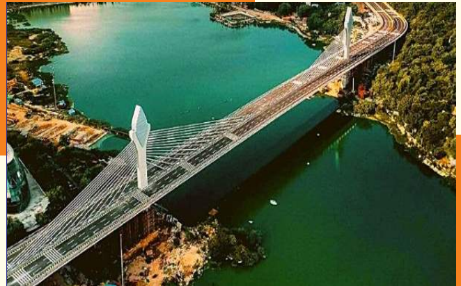
Durgam Cheruvu Lake Bridge -Telangana